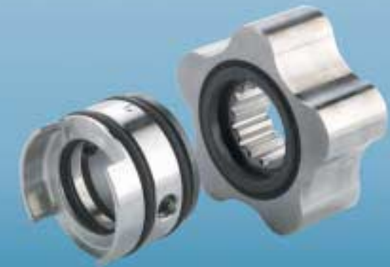
Multi-Lobe Rotor with Single Mechanical Seal.

The simple solution to accurate trouble free fluid handling.