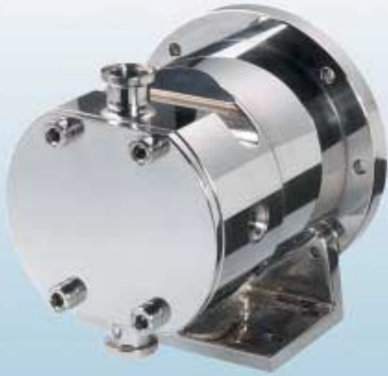
The AccuLobe Pump showing foot mounting bracket.