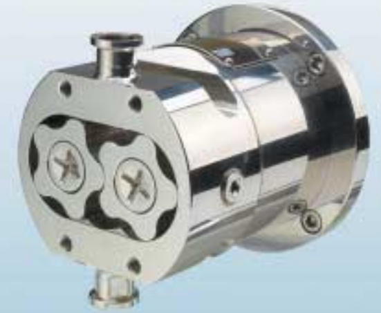
Profiled front cover joint and self draining rotorcase.