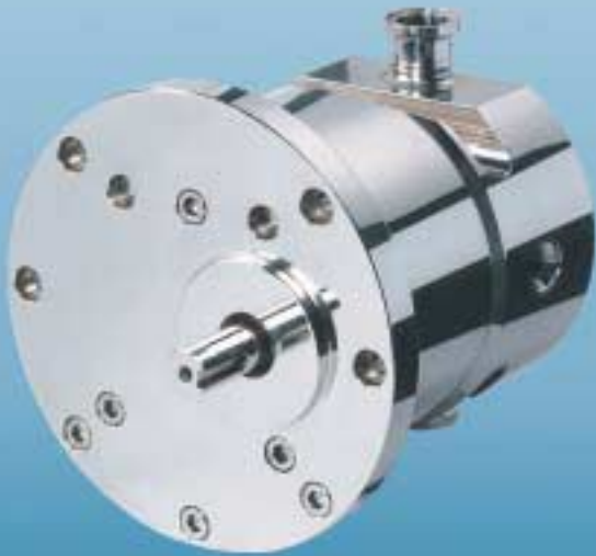
Drive shaft and bulkhead mounting register.

The simple solution to accurate trouble free fluid handling.