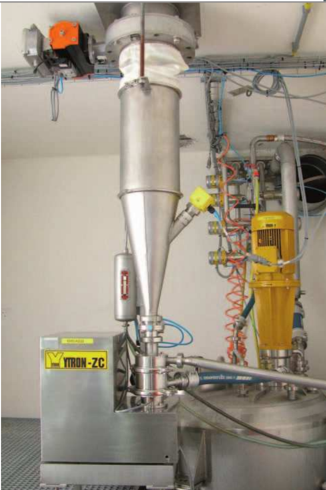
YTRON-ZC with powder addition via silo Application: Suspending of Spices