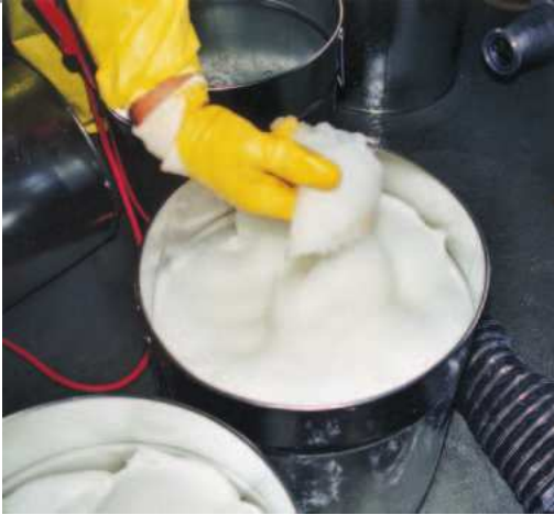
Product example: Carbopol - Concentration approx. 12%