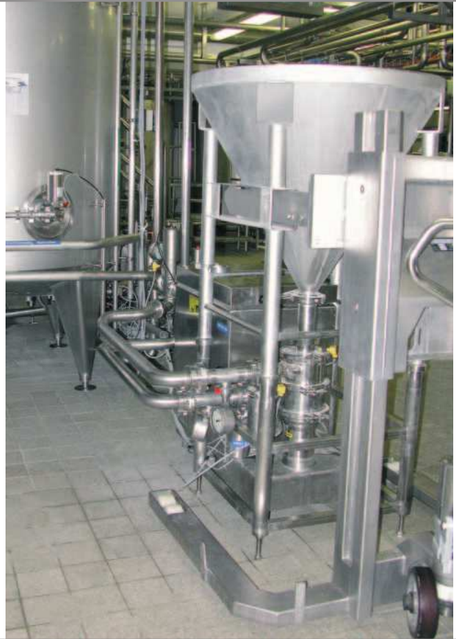
YTRON-ZC in the Dairy Industry Application: Dispersing of a Protein Hydrolysate