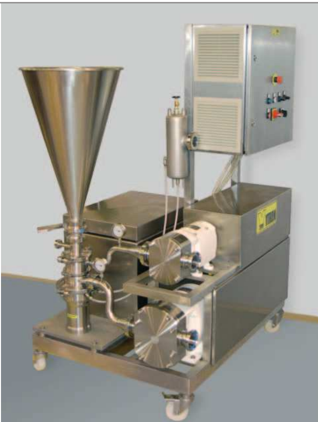
YTRON-ZC ViscoTron for high viscosities and/or high solids ratio